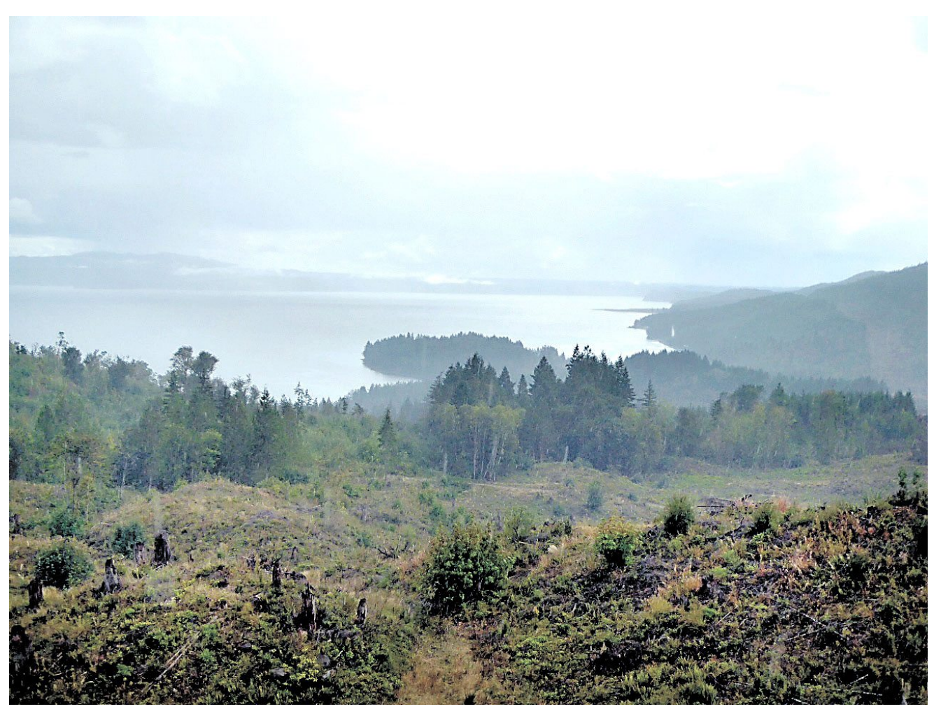
The Dabob Bay Natural Resource Conservation Area will grow by 3,393 acres under an executive order from commissioner of public lands Peter Goldmark. (Peninsula Daily News)

Sunday, December 25, 2016 10:21am NEWS JEFFERSON COUNTY